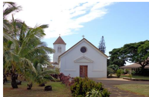
OLD HISTORICAL CHURCH

ST. RAPHAEL CHURCH Oldest Catholic Church on Kauai – est. 1841 3011 Hapa Road, Koloa, Hawaii 96756 Phone: (808) 742-1955 Fax: (808) 742-1845 Rectory: (808) 320-8758 Website: St-Raphael-kauai.org Email: straphael@rcchawaii.org